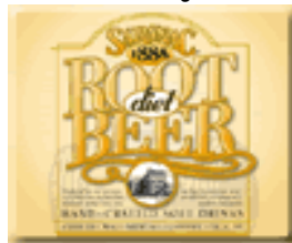
Diet Root Beer